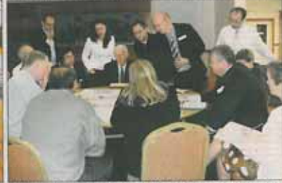
Key stakeholders influencing the delivery of a more attractive and prosperous area as part of the widespread consultation process for the Joint Core Strategy documents. "It is important that people living and working and travelling within the Black Country take time to consider and comment on the options and discuss contained within the proposals, as they will affect everyone. More information including detailed proposals for the regeneration corridors and the centres of Bransley Hill, Walsall, West Bromwich and Wolverhampton can be found in the Core Strategy Preferred Options document. This can be viewed at council offices, information centres in the Black Country and at http://blackcountrycorestrategy.dudley.gov.uk . Copies can be requested from blackcountrycorestrategy@dudley.gov.uk .