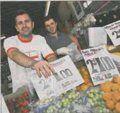
The Joint Core Strategy seeks to increase the amount of shopping, office and leisure development in Bransley Hill, Walsall, West Bromwich and Wolverhampton. "What the Joint Core Strategy lacks in hard-line planning measures, it more than makes up in terms of opportunity. There are some critical and difficult choices to be made that will have a major impact on the area over the next 20 years. I would encourage everyone to take some time to look at the proposals and make comments."