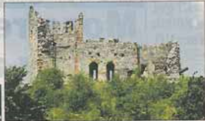
Dudley Castle represents the a vital part of the rich historic character of the Black Country that the Joint Core Strategy is seeking to preserve and enhance for the future.